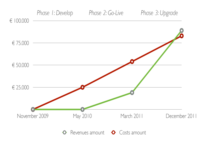
Fig. 3 Business growth.

1) Phase-1 "Startup/Develop" : In the first phase the system architecture was designed and most technical decisions took place. All data collection procedures and data processing features were defined. In this phase the legal aspect of the personal data processing was defined and authorization by the